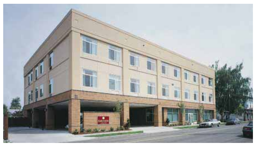
Because of seismic conditions in the Pacific Northwest, the Emerson House Residential Care Facility in Portland, Ore., was constructed with a precast modified moment-frame system. The system expedited construction on the tight urban site during rainy winter months.

"Assisted-living centers bridge the gap between living independently and living in a nursing home," says a spokeswoman for AAHSA. Assistedliving facilities accounted for 75 percent of new senior housing in 1998, when 50,667 such centers were constructed, the group says. (Although many such facilities are called assisted-living centers, the category actually includes a large number that offer housing options for those who require no assistance at all at present and simply prefer a lifestyle that requires less work and a proximity