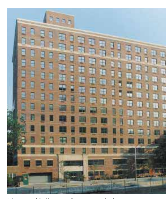
The use of hollowcore floors instead of castin-place concrete at Senior Quarters at Riverdale, a 14-story assisted-living project in the Bronx, N.Y., resulted in a savings of $8 to $9 per square foot.

The façade is sheathed in precast concrete panels with red thin-brick insets that provide an attractive, durable and easily maintained surface, Arbuckle explains. Approximately 59,000 square feet of gullwing spandrels and panels were used on the exterior, with window openings angled at 45 degrees to assure